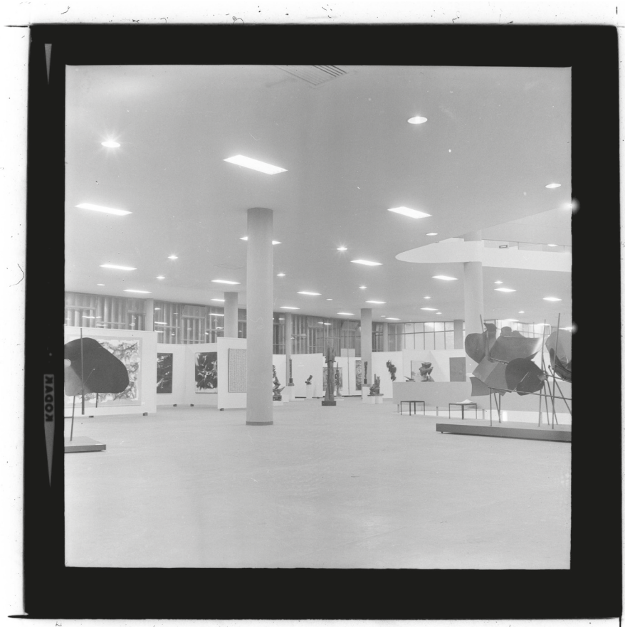
fig. 2 Installation view of the USA Representation, 6 th Bienal de São Paulo, 1961.

Returning to the 6 th Bienal, Mário Pedrosa informed Porter McCray that a space of 540 m 2 was reserved for MoMA. 36 It is worth recalling that 1961 was the Bienal de São Paulo's ten-year anniversary and the size of the exhibition and the volume of works exhibited were considerable, a fact that contributes towards understanding the magnitude of MoMA's commitment to this biennial. Frank O'Hara selected twenty-seven paintings, seven drawings and ten metal sculptures by Robert Motherwell, along with seventeen terracottas and twenty-one drawings by Reuben Nakian. To participate in the engraving section, William S. Lieberman selected twelve woodcuts by Leonard Baskin. For his part, William C. Seitz organised the group of eleven artists: Burgoyne Diller, Ellsworth Kelly, Leon Golub, Richard Diebenkorn, Richard Pousette-Dart, Sonia Gechtoff, Stephen Greene, each with two paintings; and the sculptors John Chamberlain, Lee Bontecou, Robert Engman, with two sculptures apiece, and finally Richard Stankiewicz, with three. 37 Seitz characterised this heterogeneity as positive, since he understood that "these artists will make clear [...] how diverse and alive art is in the United States at the present moment". 38