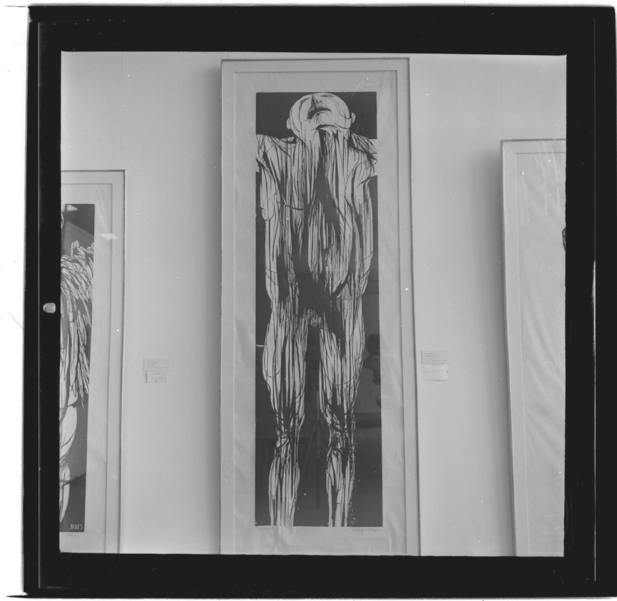
fig. 4 Leonard Baskin, Everyman, 1960. Woodcut, 210,50 cm x 60,32 cm, 6 th Bienal de São Paulo.