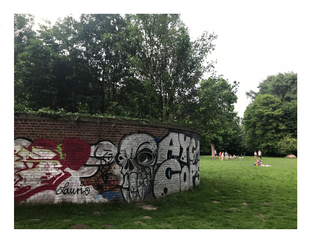
fig. 5 herman de vries. sanctuarium , 1997. Brick, sandstone, gold leaf, earth, Ø12 × 2.85m. Münster, Germany.

If in Stuttgart de vries's universal ideal of non-intervention was charged with site-specific political potency, in Münster we encounter various vernacular appropriations that subvert the very principles that underlie the work, repurpose it, and reshape its affectivity. Local residents design nature by "seed bombing", scientists "objectify" nature by tracking and quantifying, and graffiti artists infuse the work with a sense of confrontational urgency—a far cry from de vries's ideal of harmonious, meditative contemplation. Moreover, while in Stuttgart