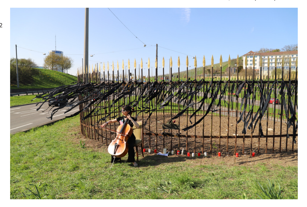
fig. 2 herman de vries. sanctuarium, 1993. Steel, gold leaf, earth, Ø12 × 2.85m. Stuttgart, Germany.