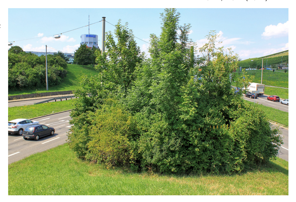
fig. 1 herman de vries. sanctuarium, 1993. Steel, gold leaf, earth, Ø12 × 2.85m. Stuttgart, Germany.

official request for clarification with the city council for this "ruthless" action, <sup>39</sup> and finally the mayor apologised and promised it would not happen again. Only members of the conservative Christian Democrats said that the work "screamed" for this cut and that it actually did the artist a service by increasing his market value. <sup>40</sup>