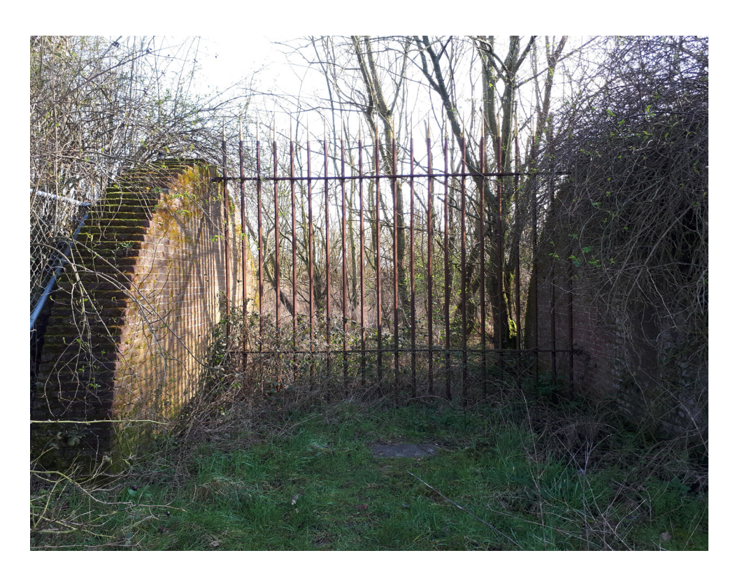
fig. 6 herman de vries. sanctuarium, 1999–2001. Earth, brick, steel, gold leaf, Briar rosebushes (Rosa canina), stone, Ø30 × 3.3 m. Zeewolde, Netherlands.

Just in front of the opening lies, almost secretly, a small, flat rectangular stone, reminiscent of an entrance rug, on which the artist engraved the words: "to be"—one of his favorite existential mantras, typical of his laconic use of language and his primary philosophy of pure presence: simply "to be" with nature (how can one "be" with nature when one is so thoroughly barred from it? This is one of the problematic paradoxes of the sanctuaries, but its consideration exceeds the scope of this paper). Art historian Claudio Pizzorusso finds a parallel between de vries's simplified lingo to the teachings of Saint-Francis, who conveyed his