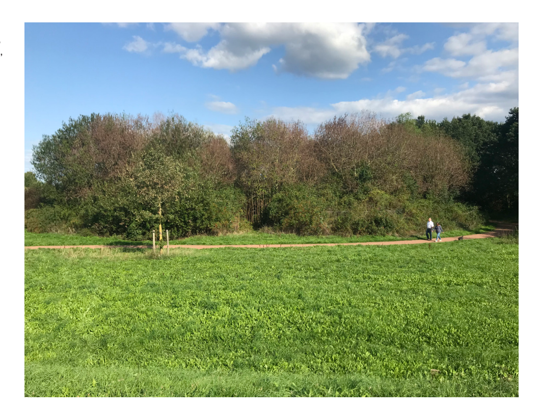
fig. 6 herman de vries, sanctuarium, 1999–2001. Earth, brick, steel, gold leaf, Briar rosebushes (Rosa canina), stone, Ø30 × 3.3m. Zeewolde, Netherlands.

This quick growth must be related to the fertile land, but also to the complete lack of intervention by the local municipality. This, ironically, is a result of the failures of public art in Flevoland, not its successes. Curator Martine van Kempen, co-founder of the Land Art in Flevoland organisation, explains that many residents of Zeewolde were displeased with the large-scale installations which suddenly took over their town as part of the ARTificial Natural Networks programme. Sculptures in public space were constantly being vandalised. This tension with the local community, in addition to some budgetary issues, were the reasons for the shutting down of De Verbeelding, the organisation behind ARTificial Natural Networks. The public artworks were left to decay, with no funds found for their maintenance. A website dedicated to art and cultural heritage in Flevoland decries the fact that "[t]he works of art are no longer being maintained and slowly the sanctuary is being overgrown by nature".