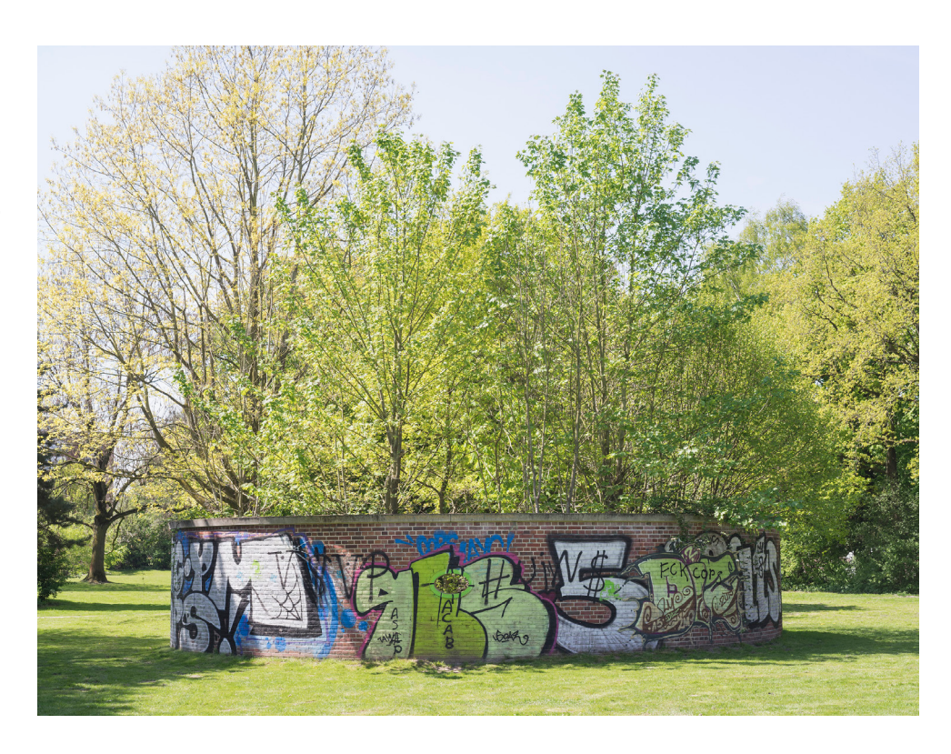
fig. 3 herman de vries. sanctuarium, 1997. Brick, sandstone, gold leaf, earth, Ø12 × 2.85m. Münster, Germany.

de vries went one step further here in blocking the public, moving from vertical stakes to a brick wall, measuring 3 metres in height and 14 metres in diameter, topped by a ring of local grey sandstone. Ferhaps the artist had felt that in such a central spot of the park, more protection was needed. In any case, one is immediately struck here by the fortified, hermetic appearance [fig. 3]. Unlike the transparency of the Stuttgart sanctuary, here only four oval holes, situated at eye-level, allow people to peep inside, meaning that only from a very close distance one can fully appreciate the vegetation inside—an experience for pedestrians rather than drivers. Inscribed above each hole is a sentence in Sanskrit, quoted from the ancient Hindu Upanishads . It translates as follows: "om. this is perfect; that is perfect; perfect comes from perfect; take perfect from perfect and the remainder is perfect". Like the Latin in the title sanctuarium , the use of the ancient liturgical language of Sanskrit contributes to the air of sanctity and primordiality. Again, we see how de vries alludes to nature's immanent immaculateness, from which humankind must be kept at a safe distance—as viewers only.