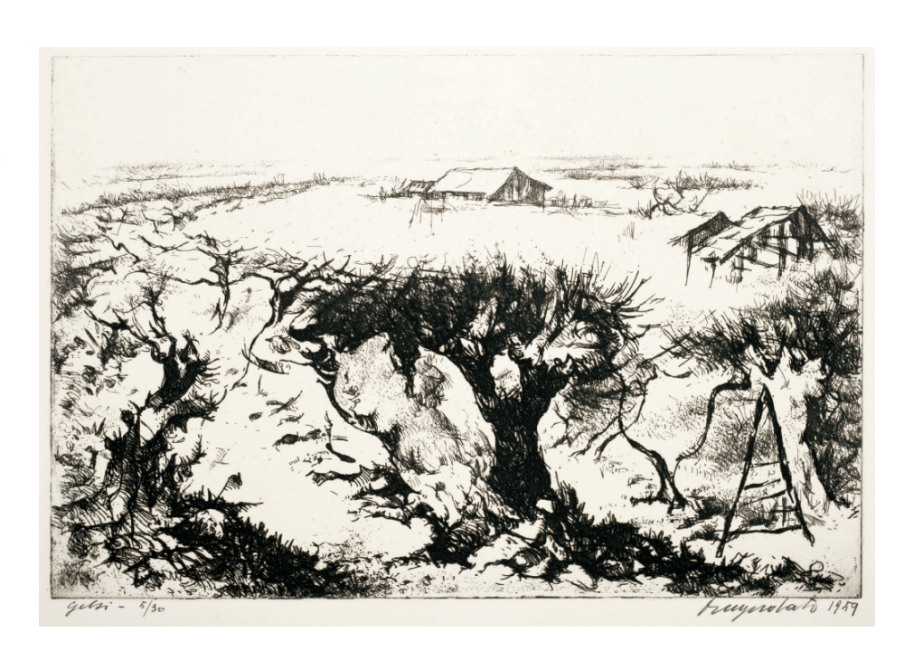
fig. 3 Cesco Magnolato, Gelsi ( Mulberries ), 1954 (perhaps reprinted in 1959. Etching. https://museodelpaesaggio. ve.it/autore/cesco-magnolato/

Under Ponti and Gian Alberto Dell'Acqua (Segretary General installed in 1958 after Pallucchini resigned) the "new spirit" and internationalism emerged in Arte Informale (or Informalism). Ponti celebrated the expressive lines, material and vibrant colours employed by artists who matured in the post-war period, including Wols. The display of Informalism in Venice, as Nancy Jachec has argued, communicated that the international exhibitions would be in "rapport" and competitive with contemporary, Western European culture, signaling Italy's renewed alignment with pro-democratic European states. Exemplifying this direction, Great Britain displayed the work of vanguard printmaker, Stanley William Hayter. That year's Premio Presidente further evinces this commitment: Fayga Ostrower won the international prize while the Italian prize went to Lojze (Luigi) Spacal. The latter gained prominence after World War II for his woodcuts of bold, geometric shapes and flat expanses of colour that yield an abstracted landscape, "nourished by [the]