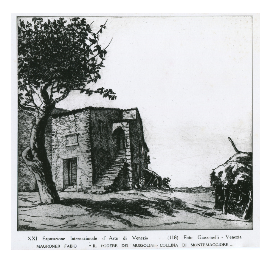
fig. 1 Fabio Mauroner, II podere dei Mussolini (The Mussolini Estate), 1938. Etching. Esposizione Biennale Internazionale d'Arte 1938.